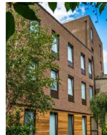
Tune Hotel, Folgate Street, London

Printed colour samples are as accurate as the printing techniques allow and are for guidance only. It should be noted that as materials used in the manufacture are from natural sources variations in shade, texture and dimensions can occur.