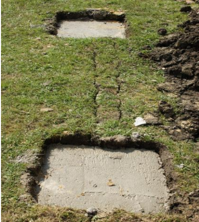
Typical Concrete Pad finish

For each pad dig out a hole, 450mm square x 450mm deep. (the 450mm depth is a minimum and it may be necessary to check with local building regulations) . If the base of the hole is not firm it will be necessary to dig deeper until you reach firm ground. Fill the holes with concrete to the level specified on the concrete pad layout plan .